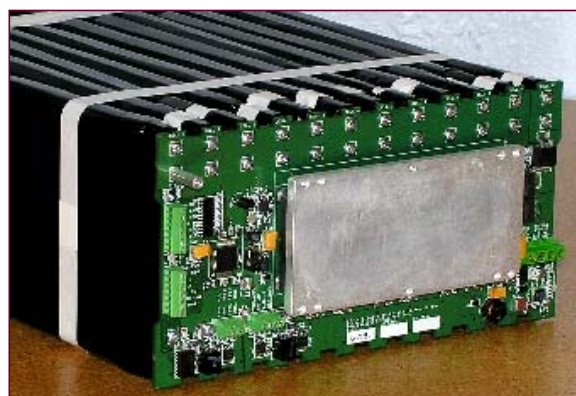
The 1.7 kWh module has been tested in 250V batteries with load profiles, overload, and shorts.