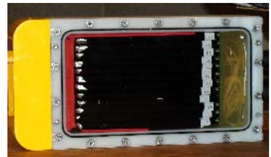
Modules can be efficiently adapted to fit your housing.

Phoenix produces a range of modules for assembly into batteries of any voltage, power, or energy level. Upon request, module configurations can be optimized for specific requirements. Several high energy modules have been developed for 21 inch and larger diameter UUVs.